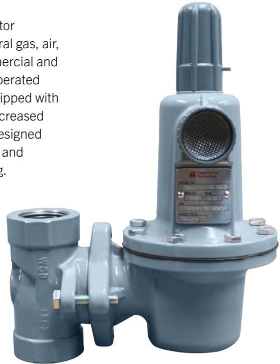
Flow Capacities, scfh of 0.6 Specific Gravity Gas, Based on 20% Droop

The model 5646C pressure regulator provides economic control of natural gas, air, or a variety of other gases in commercial and industrial applications. This self-operated pressure reducing regulator is equipped with an integral pitot (boost) tube for increased flow capacities and stability. It is designed for inlet pressures up to 1000 psig and outlet pressures from 5 to 200 psig.