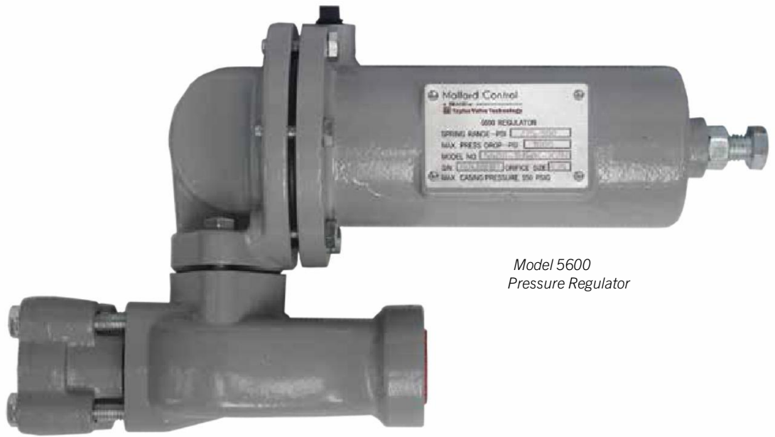
Model 5600 Pressure Regulator

environments. It is designed for inlet pressures up to 1500 psig and outlet pressures from 27 to 500 psig. Model 5600 is well suited for high pressure, high capacity applications.